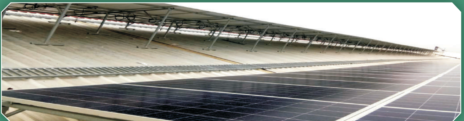
Top Food Namkin Private Limited