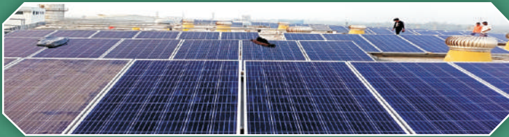
Gujarat Industrial Power Corporation Limited