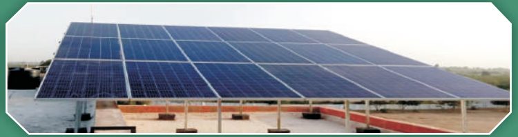
Government Building Under GEDA