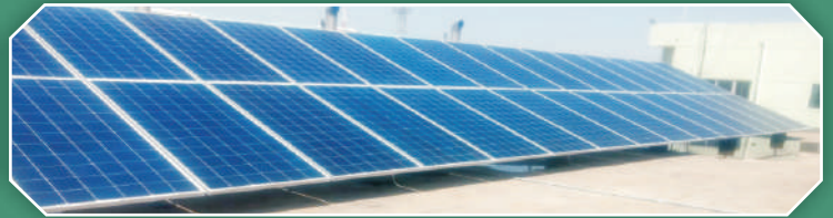
Indian Oil Corporation