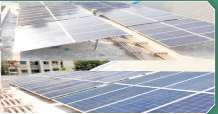
Ahmedabad Municipal Corporation