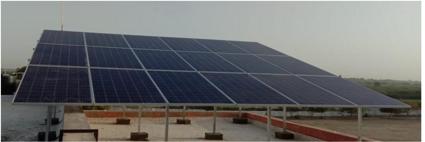
Government Building under GEDA