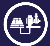
SOLAR PUMP SOLUTION