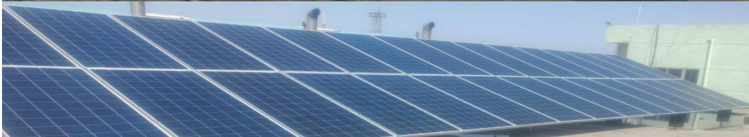
Indian Oil Corporation Limited