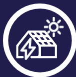
OFF GRID SOLUTIONS