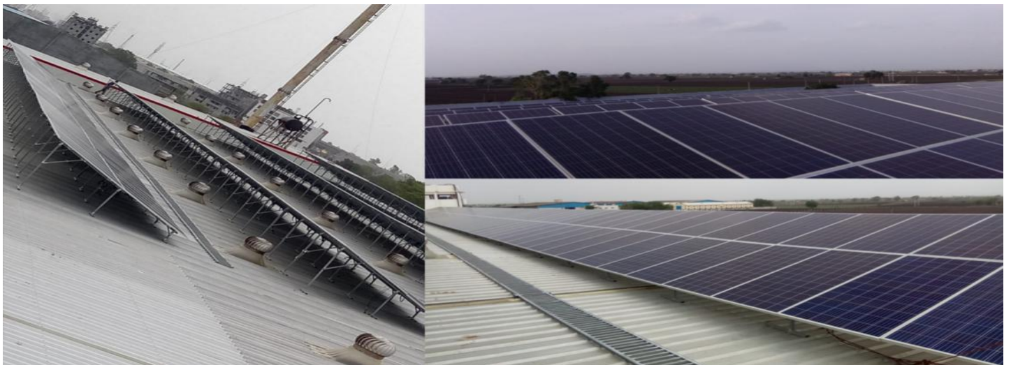
Top Food Namkin Private Limited