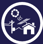
ON GRID SOLUTIONS

Different types of solar energy creation and distribution services available at SCPL: