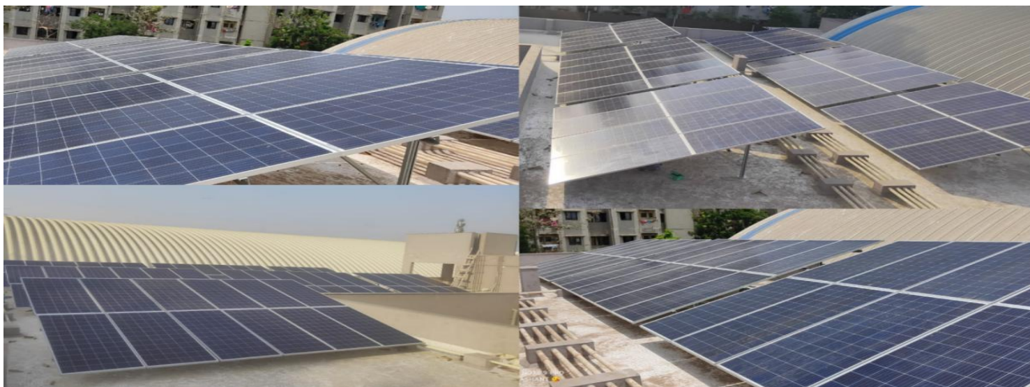
Ahmedabad Municipal Corporation